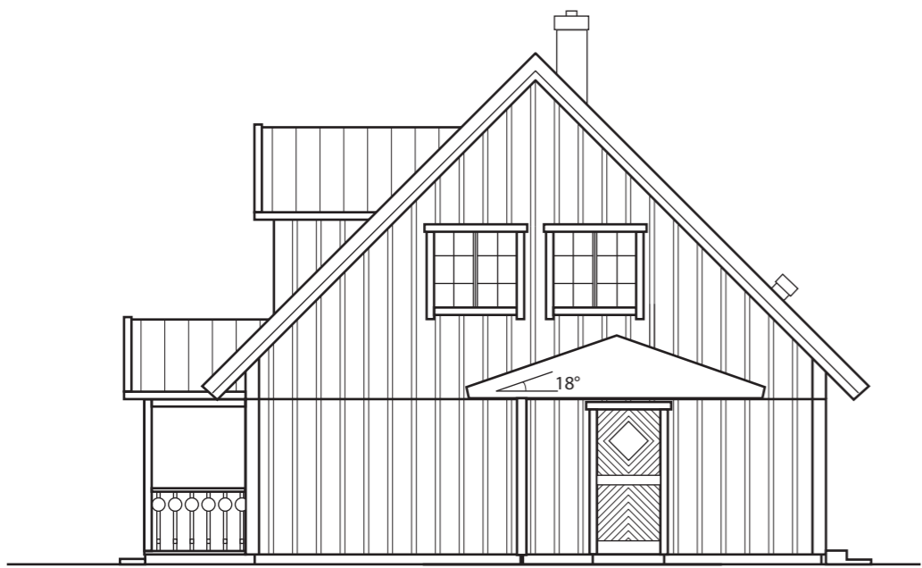
SEKTION A - A